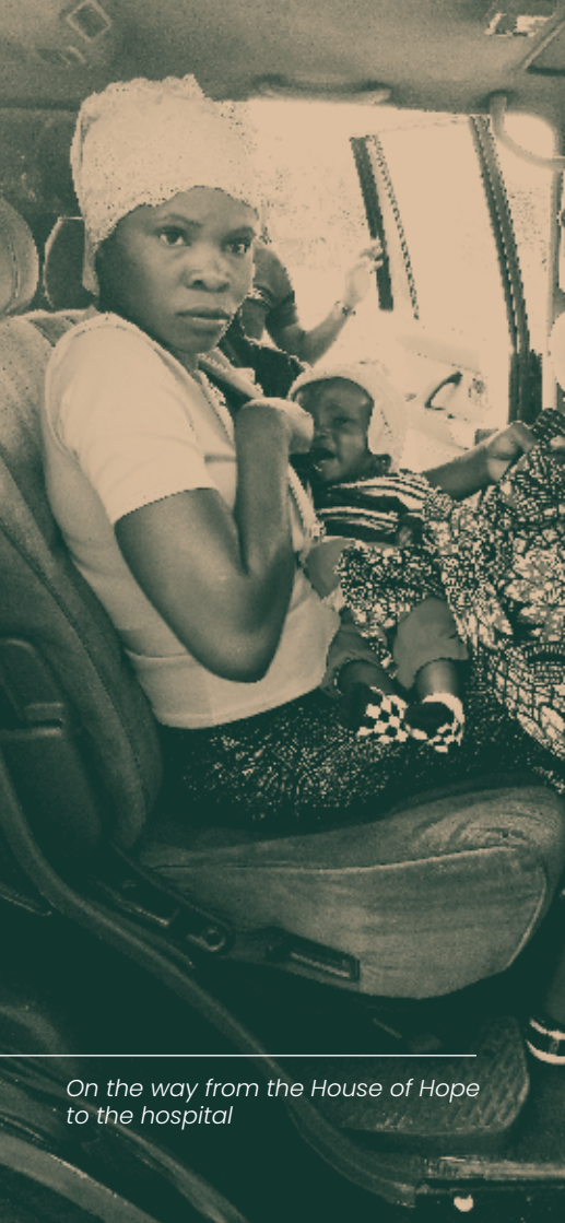
On the way from the House of Hope to the hospital