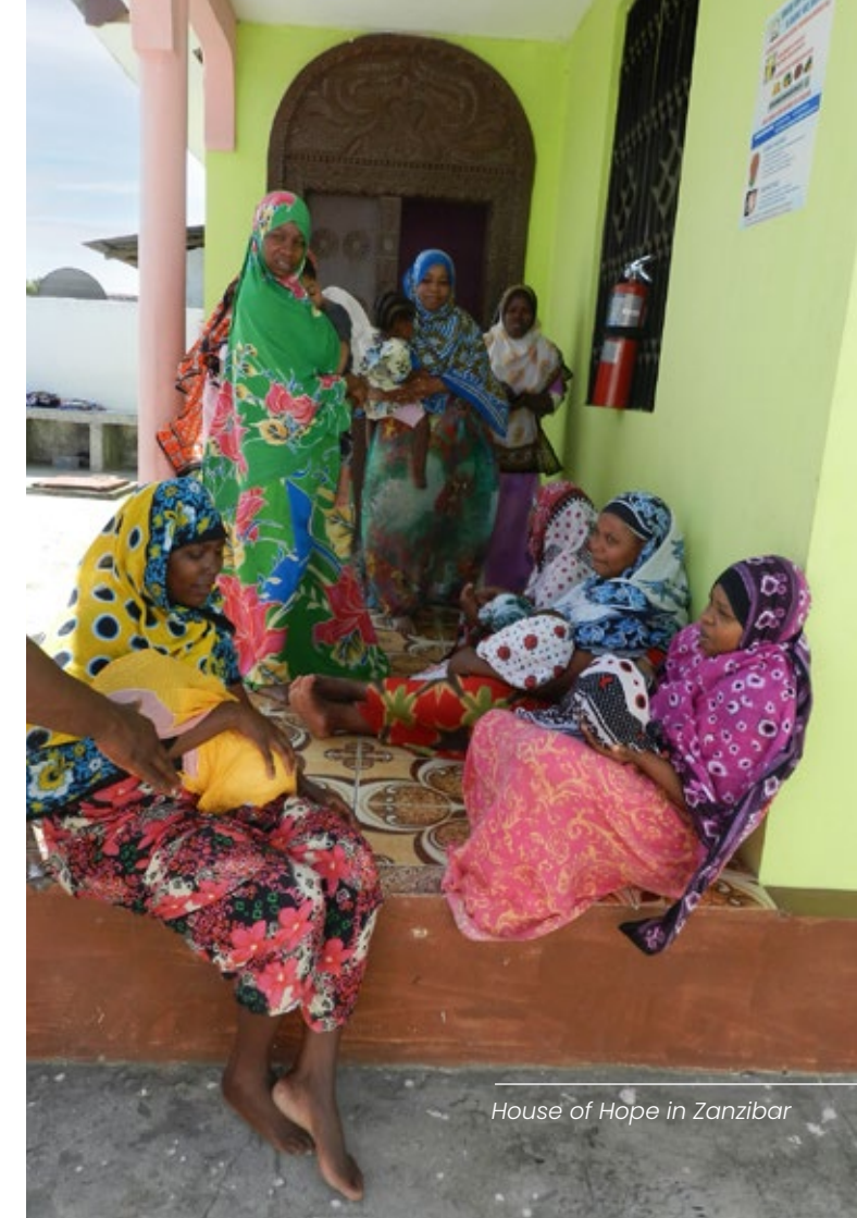
House of Hope in Zanzibar